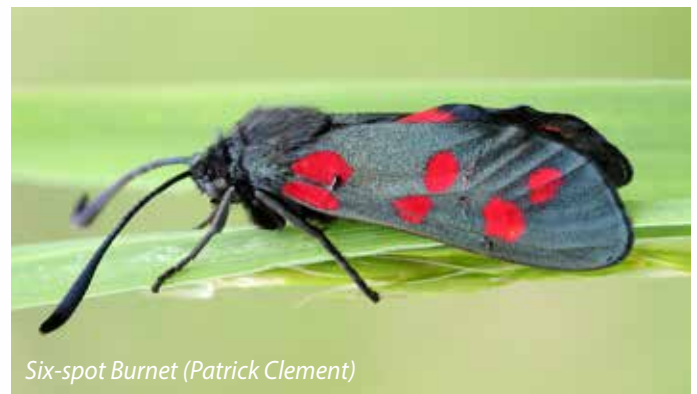
Six-spot Burnet (Patrick Clement)

ID: There are no reliable features – the most straightforward distinction is that, typically, the rarer Five-spot often has the two (sometimes all three) central wing spots in close proximity, or slightly merged, whereas the much more common Narrow-bordered almost always has these spots separated and well defined. If possible, check the border to the hindwing, as this can provide additional identification evidence. A good rule of thumb is: merged spots and a broader border = Five-spot; separated spots and a narrower border = Narrow-bordered . A further clue is the plants nearby – a five-spot burnet in an area where bird's-foot-trefoils are absent is almost certainly a Narrow-bordered.