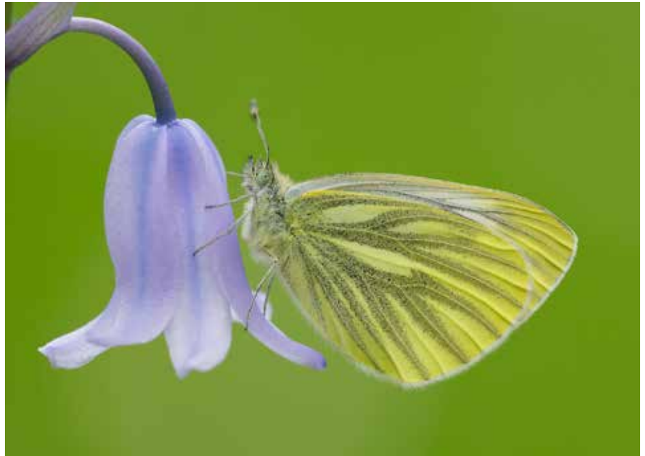
Green-veined White (Iain H Leach)