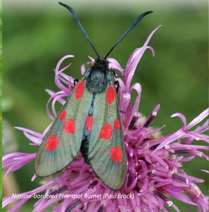
Narrow-bordered Five-spot Burnet (Paul Brock)