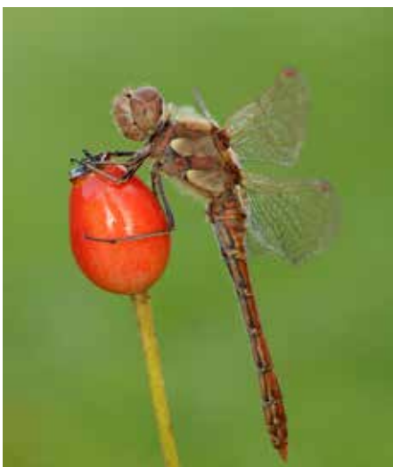
Common Darter (Iain H Leach)

Dragonflies were counted in 184 squares (23%) of all squares surveyed, thirteen percentage points fewer than 2016. A total of 1,844 individuals of 23 species were counted. Common Darter was the most widespread dragonfly occurring in 40% of WCBS squares (6 percentage points higher than in 2015). Brown Hawker and Southern Hawker were reported from one-third of all squares.