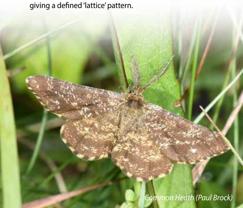
Common Heath (Paul Brock)

ID: While some poorly marked Latticed Heaths can appear like well-marked Common Heaths, the more clearly defined pattern of Latticed generally allows separation. In addition, when at rest, Latticed Heaths usually hold their wings closed (like a resting butterfly), whereas Common Heaths rest with open, flat wings. Note the potentially confusable Grizzled Skipper butterfly has clubbed antennae.