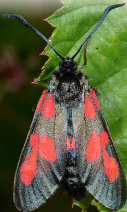
Five-spot Burnet (Paul Brock)