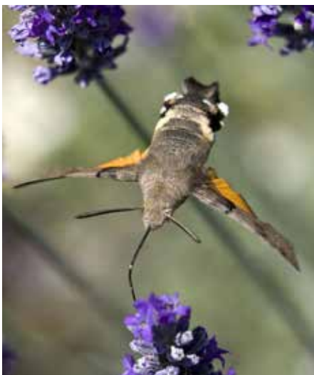
Humming-bird Hawk-moth (David George Clarke)

Moths were counted in 142 (18% of the total) squares, one percentage point greater than in 2016. In total 590 individuals of 39 species (eight more species than in 2016) were counted. Silver Y was once again the most widespread species, occurring in 37% of squares (12 percentage points more than in 2016). For the fourth consecutive year, Six-spot Burnet was the second most widespread moth occurring in 13% of squares (eight percentage points fewer than 2016). Humming-bird Hawk-moth was in the top six most widespread moth species, being found in 6% of squares, confirming this species had a good migratory year.