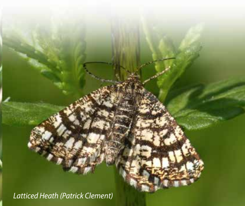
Latticed Heath