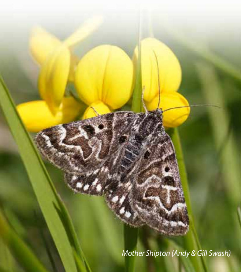
Mother Shipton

Burnet Companion has warm brown, striped forewings and distinctive orange-yellow markings on the hindwings.