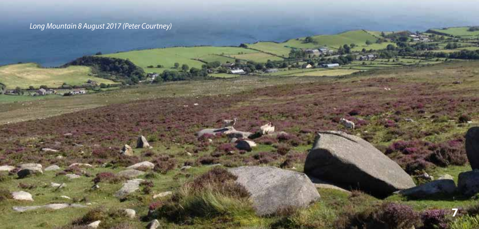
Long Mountain 8 August 2017 (Peter Courtney)

In the field: My inexperience has however yielded some useful insights. One rule of thumb I have found helpful in this regard has been 'learn by doing'. At Slievenisky, near the Mourne, I was lucky to meet a shepherd, whose quad bike I watched traverse its flank. On many sites, the main difficulties are obstacles, usually either fences or watercourses. However, on upland sites, I am often tacking between navigation features, such as prominent trees or buildings, in order to check my position. Slievenisky is quite a low mountain and fortunately the timing of our visit gave me time to talk to the shepherd about access, permission and